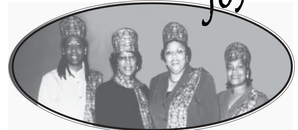
SATURDAY, MAY 17, 2003