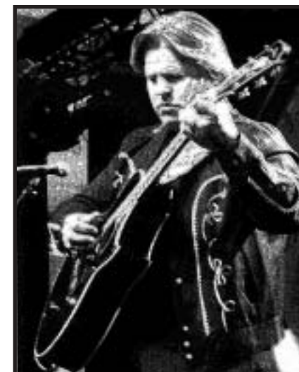
DOYLE DYKES SATURDAY, MARCH 29, 2003