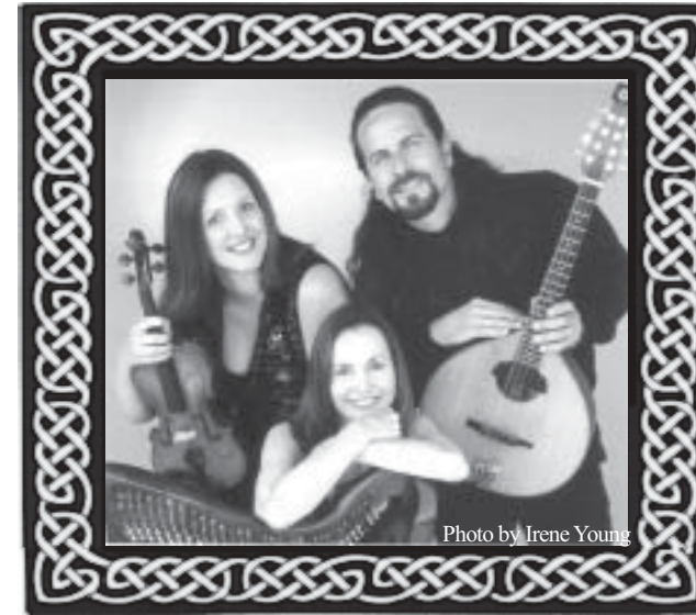
CELEBRATE CELTIC NEW YEAR SATURDAY, OCTOBER 26, 2002