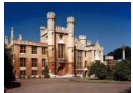
Lambeth Palace, home of the Archbishop

Dr Williams legally became the Archbishop of Canterbury at the Confirmation of Election ceremony in St Paul's Cathedral on Monday 2 December 2002. Today's Enthronement service was his formal reception and a celebration of the start of his new ministry.