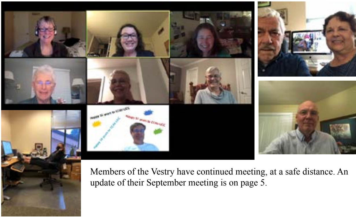
Members of the Vestry have continued meeting, at a safe distance. An update of their September meeting is on page 5.